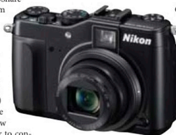
Nikon's Coolpix P7000: smaller than a digital SLR but offers similar manual controls

Coolpix P7000 ($500) aims for somewhere in-between. It's smaller than a digital SLR but offers similar manual controls allowing you to get creative with your shooting. Unlike a digital SLR, you won't get interchangeable lenses, but a 7x wide angle zoom (28-200mm equivalent) is built-in and can be used to shoot 720p HD video as well. Noise reduction and image stabilization features let you capture sharp images,