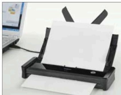
Canon Scan-tini models: draw all the power they need over a USB cable so there's no added power brick to weigh down your travel bag

I've written about Cisco's Flip pocket video cameras before; built-in FlipShare software makes them easy to use and makes it easy to share your video clips. Among new models released in time for the holidays: the Flip Ultra HD 2 Hour ($199) with a rechargeable battery and a new FlipPort connector to connect to accessories from Cisco and third parties. Available accessories include a wide-angle lens, several microphones and even a pocket projector. The various Flip camcorder models are available at many retailers, but at www.theflip.com you can order one with a colourful customized design.